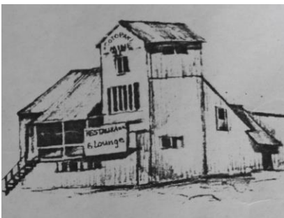
Cotopaxi Mine Tavern & Lounge