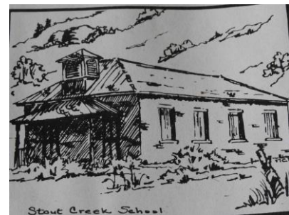
Stout Creek School

EVERYONE WELCOME TO JOIN US—FREE TO THE PUBLIC!!!